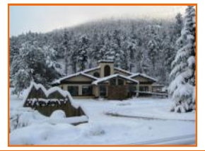
Snowy day at Harmony

Approximately 95 % of the clients admitted to Harmony with insurance have some, and, in the majority of cases, all days approved by insurance, thanks to the relentless work of our UR team. Many treatment centers nationwide are opting out of dealing with insurance for their clients due to the time consuming and often frustrating continued stay process. However, the UR team at Harmony, with the interdisciplinary help of our counseling and medical teams will continue to work exhaustively to get the maximum coverage for our clients, and remain their strongest advocates with the insurance