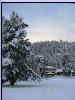
Harmony Winter Morning

A Gift for the Person who has everything... Make a donation to Harmony in their name. Receive a gift acknowledgement that you can give, to let them know of your gift. Visit our website for more information. www.harmonyfoundationinc.com